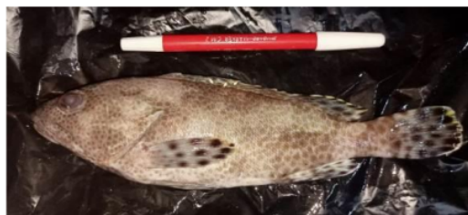
Figure 3. Epinephelus miliaris from Lappa Sinjai fish landing site, Sinjai District, South Sulawesi, Indonesia