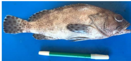
Figure 2. Epinephelus miliaris from Rajawali fish landing site, Makassar City, South Sulawesi, Indonesia

29: TL/BD: aspect ratio; TL: total length; 17: body depth; HL1: head length 1; HL2: head length 2; PFL: pectoral fin length; VFL: ventral fin length; AFL: length of 2 nd anal fin spine; and CFL: caudal fin length